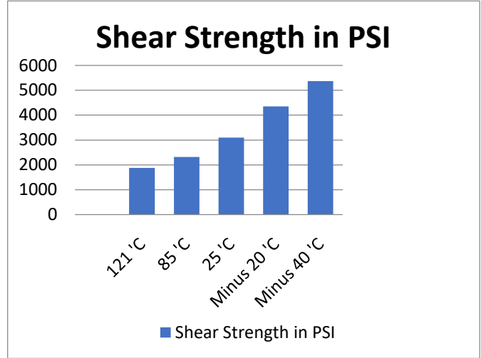
Lap Shear Strength ASTM D 1002 – Stainless / Stainless Steel